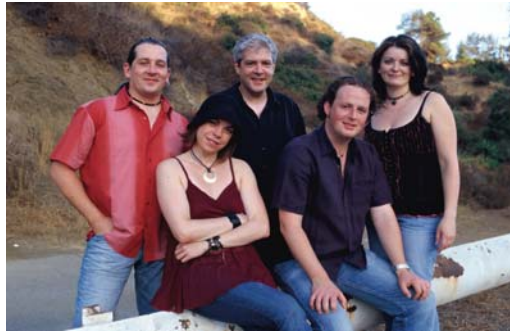
Solas: The Best Irish Band in the US

We are also offering a limited number of VIP tickets for this event! VIP tickets are